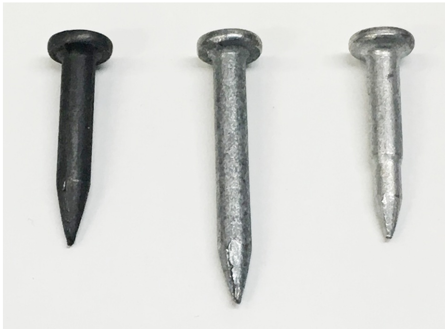
From left to right: T3034B/T4034B, T3100/T4100 and T3034S/T4034S.

3 For steel-to-steel connections designed in accordance with Section 4.1.4, the tabulated allowable load may be increased by a factor of 1.25, and the design strength may be taken as the tabulated allowable load multiplied by a factor of 2.0.