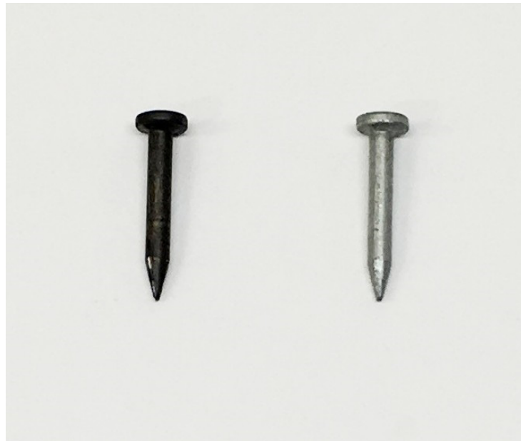
FIGURE 2—TRAKFAST FASTENER